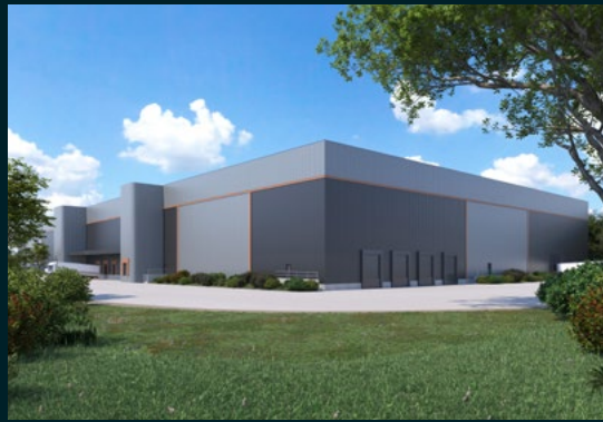
Indicative warehouse external