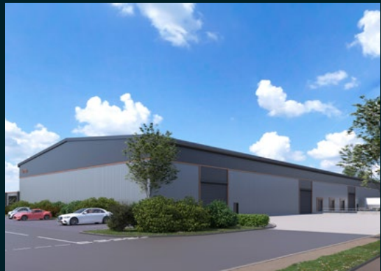
Indicative warehouse external