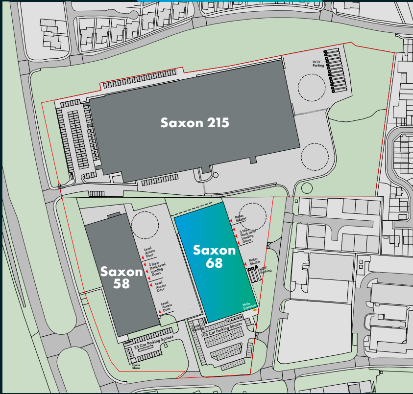
Indicative layout plan