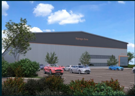
Indicative warehouse external