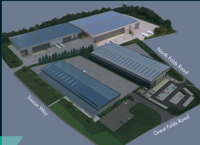
Indicative warehouse aerial