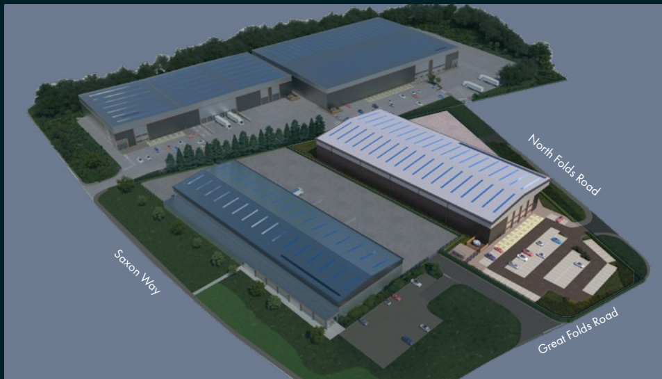
Indicative warehouse aerial