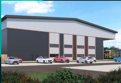
Indicative warehouse external